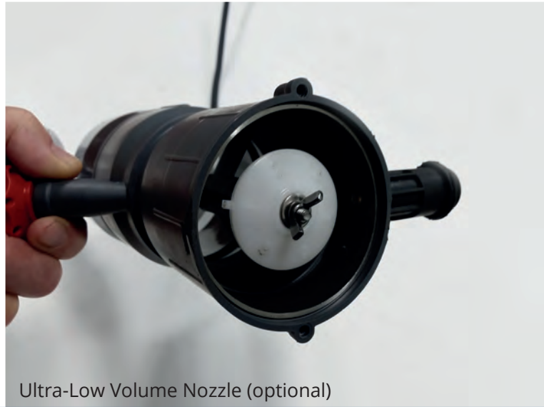
Ultra-Low Volume Nozzle (optional)