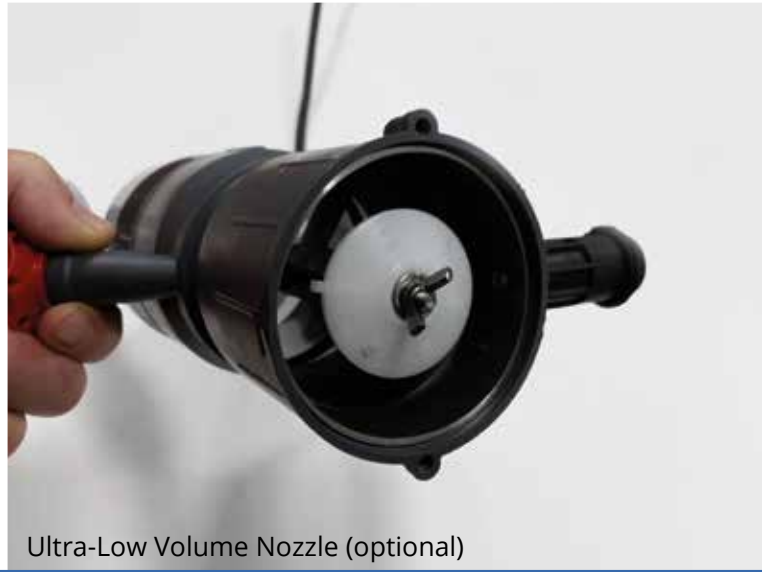
Ultra-Low Volume Nozzle (optional)